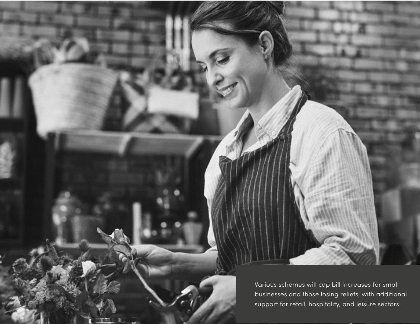
Various schemes will cap bill increases for small businesses and those losing reliefs, with additional support for retail, hospitality, and leisure sectors.

Measures include closer collaboration with unions, direct employer follow-ups, and the exploration of new enforcement powers. ◀